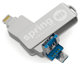
LIGHTNING & MICRO USB 168.943