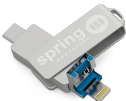
TYPE C & LIGHTNING 168.952